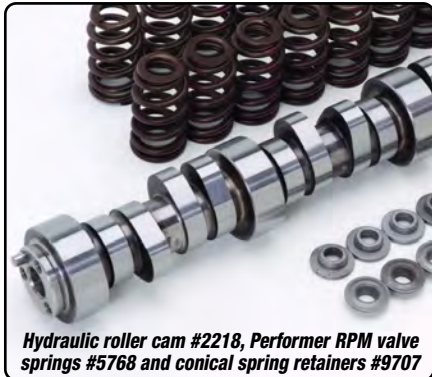
Hydraulic roller cam #2218, Performer RPM valve springs #5768 and conical spring retainers #9707