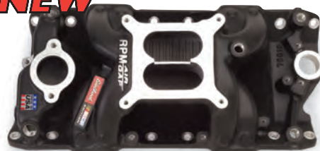
RPM Air-Gap manifold #75013 for S/B Chevy

FREE special edition hat included in the box with every purchase of any Edelbrock NASCAR Edition RPM Air-Gap manifold!