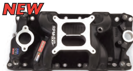
RPM Air-Gap manifold #75013 for S/B Chevy

Nothing is more American than NASCAR stock car racing and Edelbrock manifolds. Now available is the exclusive Edelbrock NASCAR Edition RPM Air-Gap manifold. Based on our popular RPM Air-Gap designs, these manifolds will deliver superior and reliable performance along with unique looks. The Edelbrock NASCAR Edition RPM Air-Gap manifolds stand out from the crowd with their durable and distinctive black powder coated finish and attractive full color emblem.