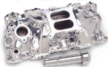
Performer EPS #27034 with EnduraShine finish

The new Performer EPS manifold #2703 combines a modern runner design with a front mounted oil fill tube for those who want the vintage look of our Classic valve covers with no breathers. The #2703 has a runner design tuned for peak torque around 3500 rpm on a 350 cid engine and is intended for square-bore carbs like the Performer Series or Thunder Series AVS. Includes Oil Fill Tube (not installed) and matching push-in Breather. The Oil Fill Tube and Breather are also available separately as #4803.