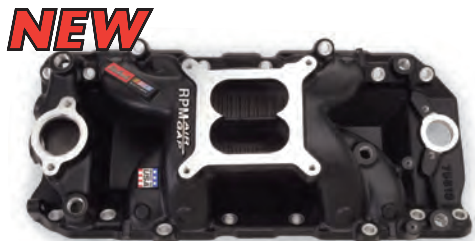
RPM Air-Gap manifold #75613 for B/B Chevy