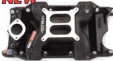
RPM Air-Gap manifold #75763 for S/B Chrysler