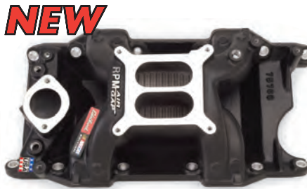
RPM Air-Gap manifold #75763 for S/B Chrysler