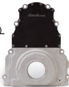
2-piece timing cover #4254