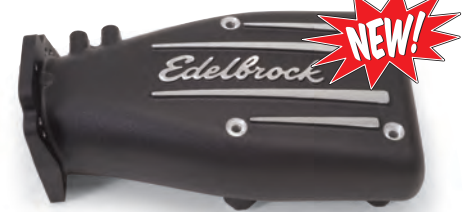
Forward Mount Box Style Intake Elbow #38503

These box style elbows add the great EFI appearance to carburetor-style EFI manifolds. Their performance matches our High Flow Elbow #3849 up to 400 horsepower. Sideways Mount Box Style Elbow #3851 is intended for sideways mounted applications. Both accept LS1, LS2 or Ford 5.0L-based throttle bodies. Go to our web site for more information.