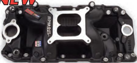
RPM Air-Gap manifold #75613 for B/B Chevy