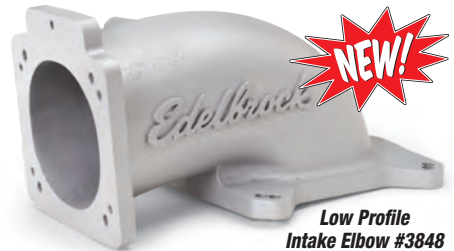
Low Profile Intake Elbow #3848

These new elbows were developed by the Edelbrock engineering team using the latest in Computational Fluid Dynamic software. Edelbrock Throttle Body Elbows are the best way to adapt LS1, LS2 and Ford 5.0L-based throttle bodies to EFI manifolds with traditional square-bore mounting pads. An internal divider optimizes flow quantity and distribution into the manifold and they can be mounted forward, backward, or sideways on Victor EFI square-bore manifolds. Three versions allow EFI tuners to position the throttle body low for hood clearance or higher for max airflow.