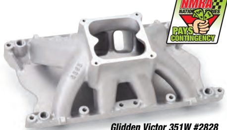
Glidden Victor 351W #2828

This new race-intended manifold was developed with noted Ford drag racer Billy Glidden. It features a 4500 series carb pad for high rpm and large displacement Windsor headed small-block Fords with a 9.5" deck height. The runner area has been enlarged and the plenum has been increased to produce more high rpm power.